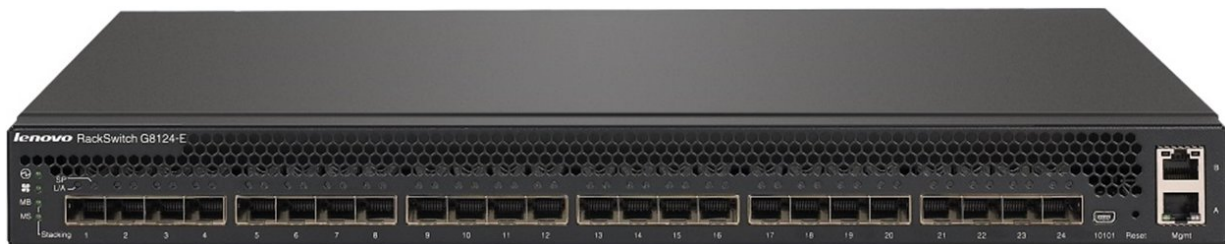
Figure 1. Lenovo RackSwitch G8124E

With support for 1 Gb Ethernet or 10 Gb Ethernet, the G8124E switch is designed for those clients that use 10 GbE today or plan to in the future. This switch is the first top of rack (TOR) 10 GbE switch that supports Lenovo Virtual Fabric, which helps clients significantly reduce cost and complexity when it comes to the I/O requirements of most virtualization deployments. Virtual Fabric can help clients reduce the number of multiple I/O adapters down to a single dual-port 10 GbE adapter and reduce the required number of cables and upstream switch ports.